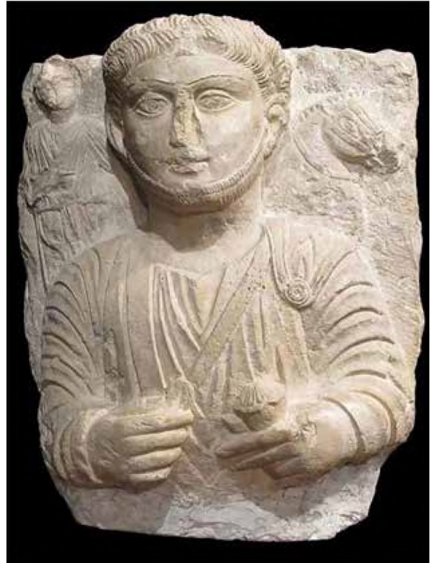
Fig. 4: Rider wearing (a long sleeved tunic and holding attributes possibly connecting them with the cavalry of Palmyra, PS119; The Archaeological Museum of Istanbul, Ingholt Archive.

If we move into the actual action of horseback riding, one such scene is depicted in Curtis fig. 6, and another figure in action is seen above in fig. 3 – these two reliefs are probably votives but with the same iconography as seen before – one of the riders has a quiver or bow but both are horseback riding and wearing their Persian outfit. The man in Long fig. 5 and in the present figs. 4-5 wears a long sleeved tunic and a mantle like the equestrians seen before. They have a horse,