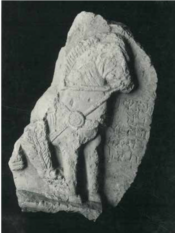
Fig. 2: A relief of a rider in Persian costume. Taimarsu. PS1173. Location Unknown. Ingholt Archive.

them on the side on a pedestal. (See Krag fig. 9 and Raja figs. 10-18).