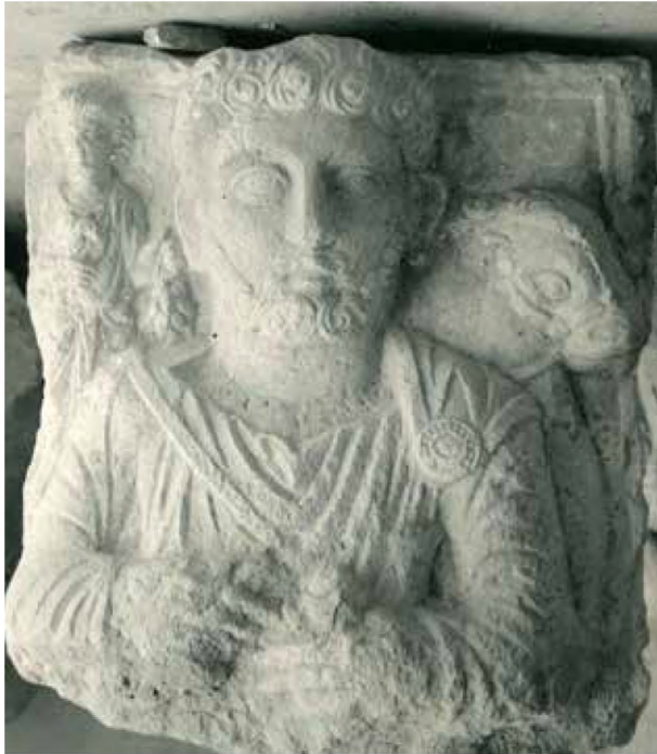
Fig. 5: Rider wearing long tunics and holding attributes possibly connecting them with the cavalry of Palmyra. The Snite Museum of Art, Indiana. Ingholt Archive (© Palmyra Portrait Project. By permission of Ny Carlsberg Glyptotek).

wears a long garment. 10 As a further matter of interest this relief carries an inscription separate to the dedication that mentions a sculptor. This direct reference is exceptionally rare. If we consider Cussini figure 1 as well as the present figure 8 we may note the camel in the background and that the man to the left has sword, whip, and quiver – he also has a long sleeved tunic, but his mantle is different to the ones worn by the horseback riders.