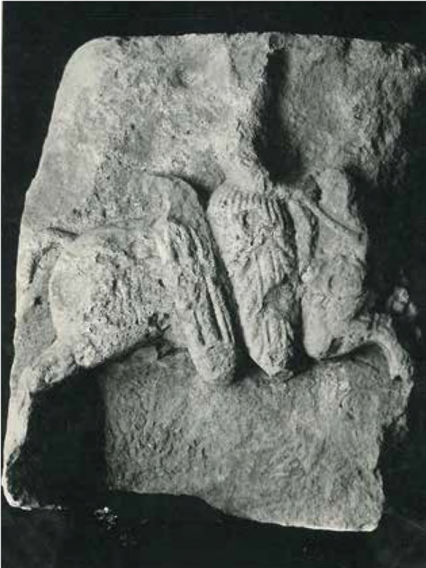
Fig. 3: A rider in Parthian outfit. Bel sanctuary, Ingholt Archive.

take a look at the figure on top of the sarcophagus we will see that he is reclining with his sword beneath him and that it is not his wife sitting at the end of the sarcophagus lid – but his horse is standing in the position she would normally occupy. So yet another horse owner in Persian outfit with long sleeved tunic, mantle, trousers and a sword. His attendant is standing next to the horse.