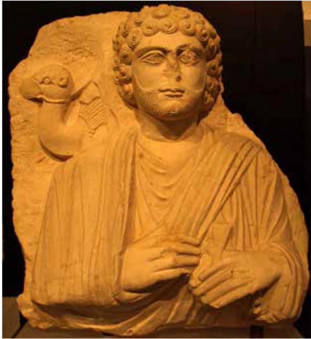
Fig. 8: A loculus relief of a male with a camel in the background, possibly associating himself with the caravan trade rather than the military. PS649, Ny Carlsberg Glyptotek.

Greece or Rome. These, and arm positioning, are seen as having several connotations and meanings rather than one in particular. The ‘arm sling’ pose adopted by many males is identified as a localised version of the ideal Greek citizen gesture, more in line with Eastern and Asia Minor cities than Rome, and yet demonstrably more assertive than the Greek originator.