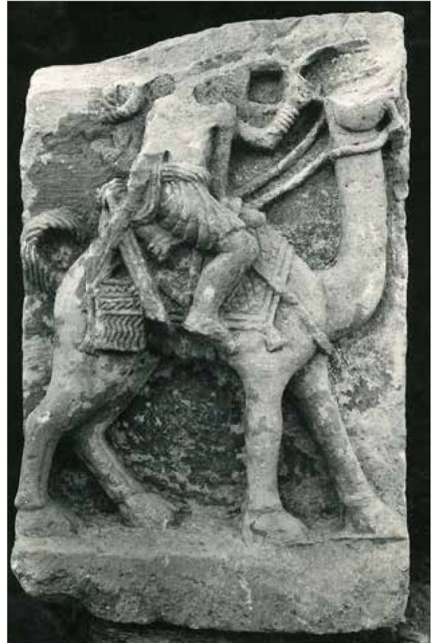
Fig. 9: A relief of a camel rider with bare legs and weapons. PS1159. Palmyra Museum, Ingholt Archive. (© Palmyra Portrait Project. By permission of Ny Carlsberg Glyptotek).

With regard to the female portraits, Davies notes the widespread use of the so-called Pudicitia type arm and hand gesture, observing the gender specific use, and also that this ambiguous pose generally represents the same general connotations as the arm-sling pose in males. It is representative of correct female behaviours of the elite and wealthy. The complexity and subtlety with which the Palmyrenes used gestures is demonstrated through the discussion of couples, or more accurately, groups of two adults, and the echoing and touching gestures they adopt to indicate a relationship, whether marriage or of blood.